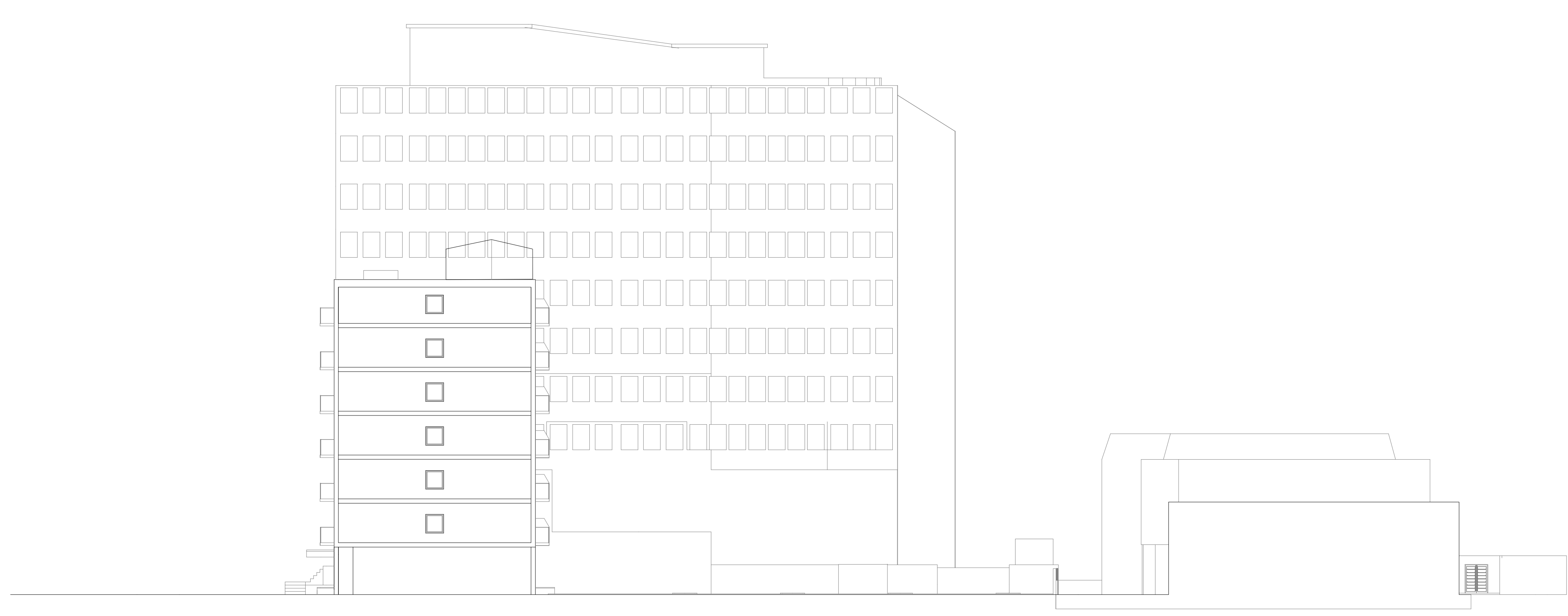
Existing North Elevation - 1:200