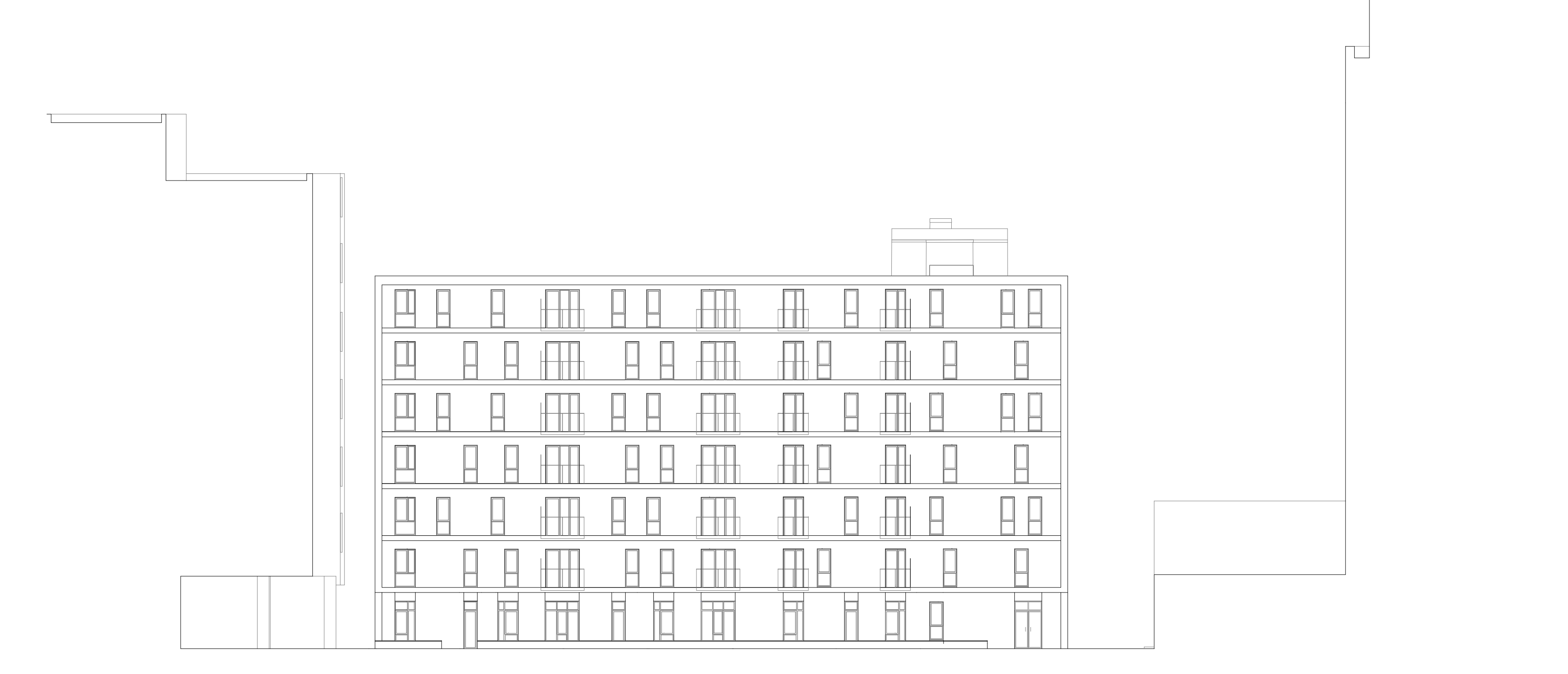
Existing Rear Elevation - 1:200